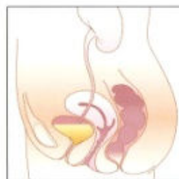
Normal position of the bladder and urethra