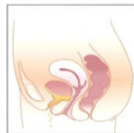
Lower than usual position of the bladder and urethra